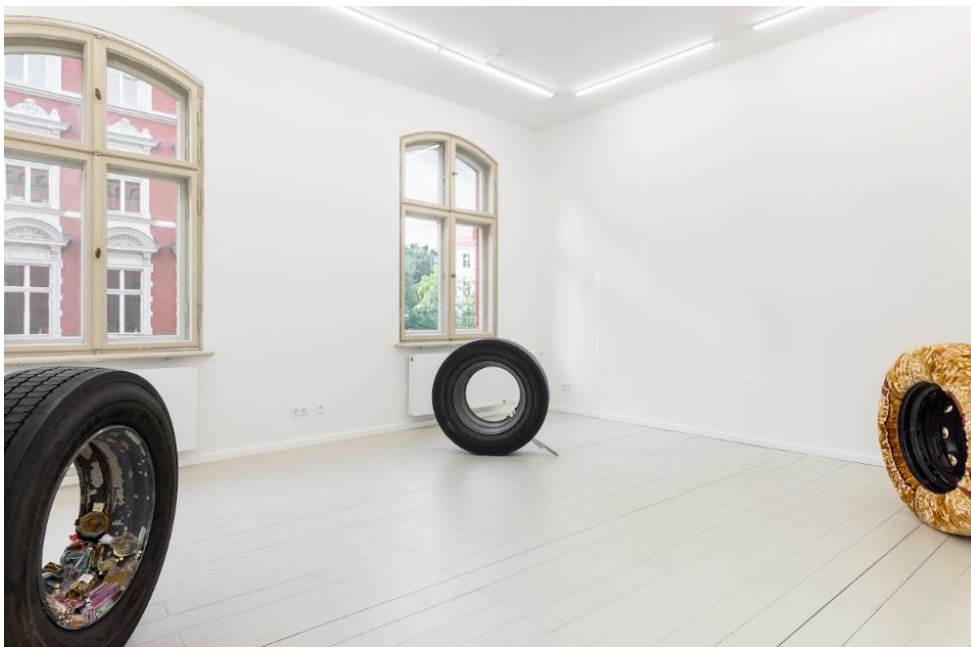
Mila Panić, Südost Paket , ongoing.