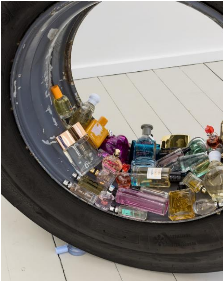
Mila Panić, Südost Paket , ongoing.