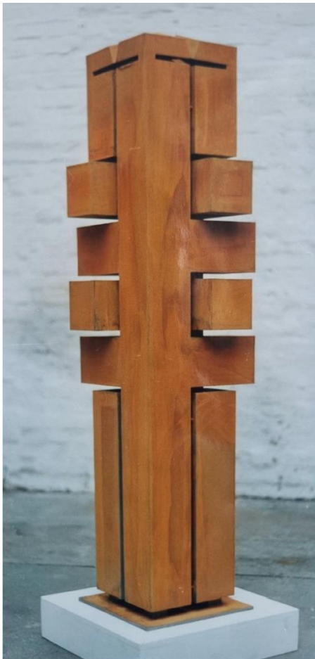
Songhak Ky, DUPLEX , 1995.