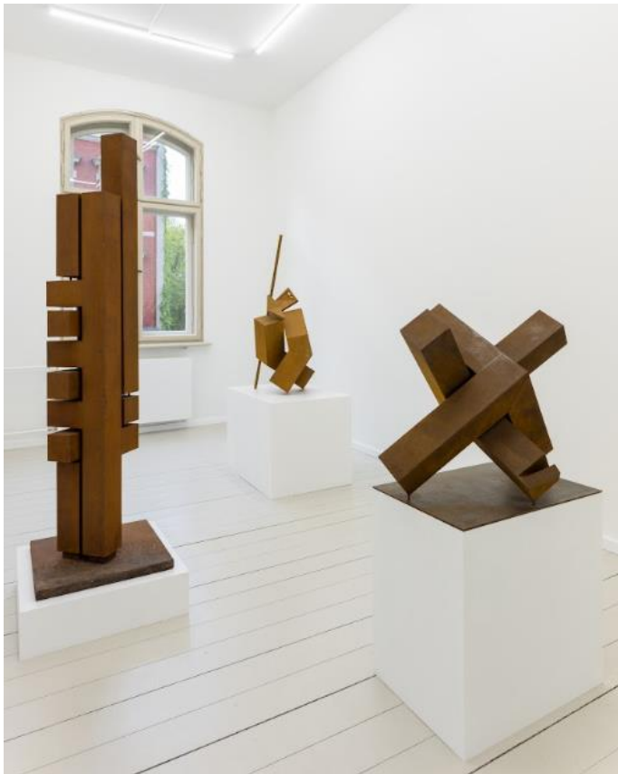
Songhak Ky, installation view Kunst Raum Mitte, 2025.