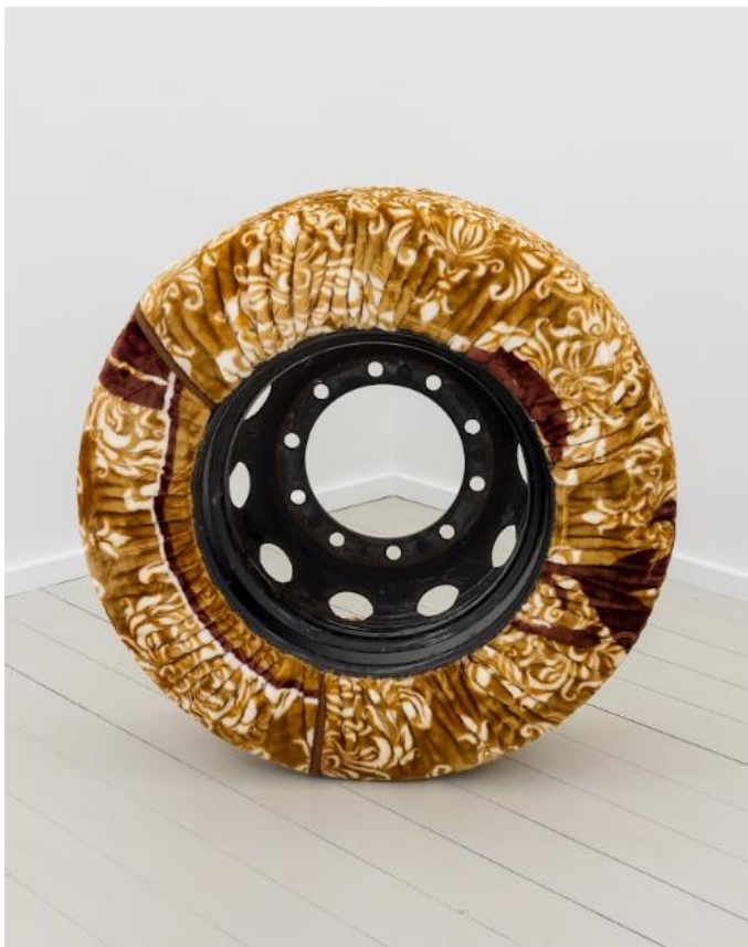
Mila Panić, Südost Paket , ongoing.