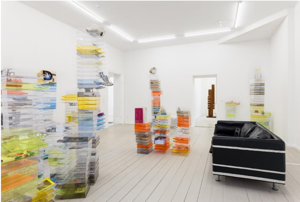
Installation view DISLOCATIONS— within reach, Kunst Raum Mitte, 2025.