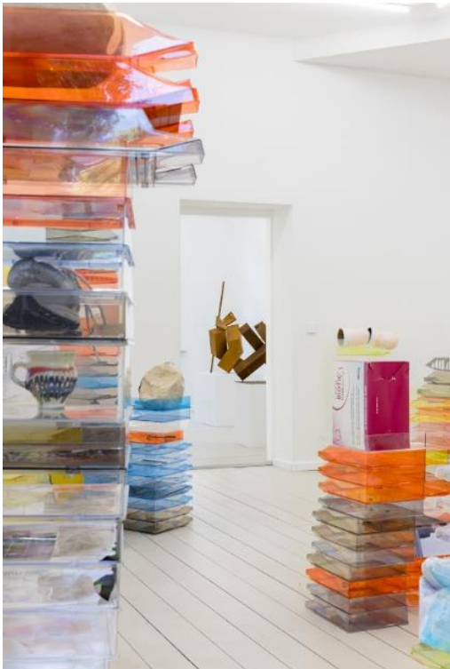
Installation view DISLOCATIONS— within reach , Kunst Raum Mitte, 2025.