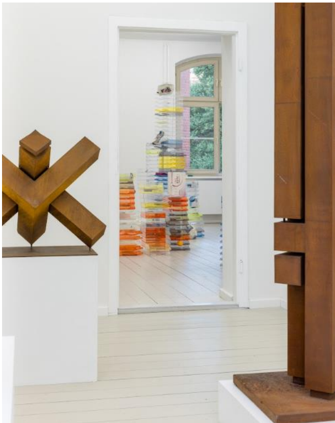
Installation view DISLOCATIONS—within reach , Kunst Raum Mitte, 2025.